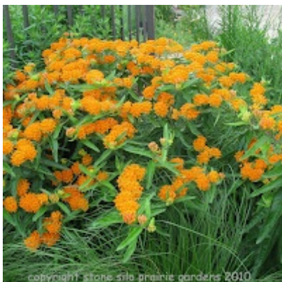
Orange Milkweed - This long-