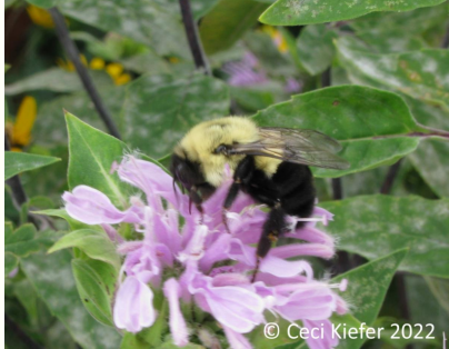
Bumblebee on Monarda Fistulosa - © Ceci Kiefer

honeybee that don't necessarily rely on dandelions to survive.